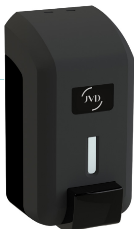
REF 8 44 1378 Cleanline foam matte black hood UL 1 : 24 REF 8 44 1379 Cleanline gel matte black hood UL 1 : 24