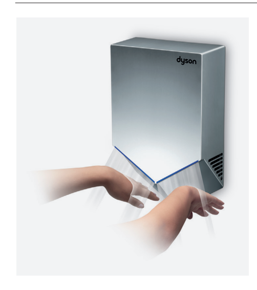
With two HEPA filters to capture 99.9% of bacteria, the Dyson Airblade V hand dryer dries hands with cleaner air, not dirty air. The fastest to dry hands hygienically with HEPA filtered air.