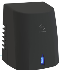
REF 8 11 1377 Copt'air automatic black alu UL 1 : 4