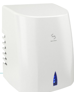
REF 8 11 1167 Copt'air automatic white alu UL 1 : 4

+ REF 5 30 1899 Anti-bacterial filter UL 1 : 1