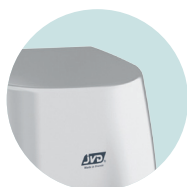
ANTI-VANDALISM ALUMINUM COVER