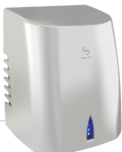
REF 8 11 1168 Copt'air automatic metallic gray alu UL 1 : 4