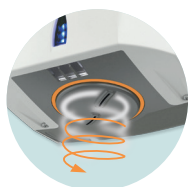
INNOVATION ROTATING NOZZLE FOR BETTER EFFICIENCY AND NEW SENSATION

+ REF 5 30 1899 Anti-bacterial filter UL 1 : 1