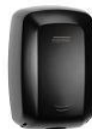
M09AB Black finish