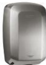
M09ACS Satin finish