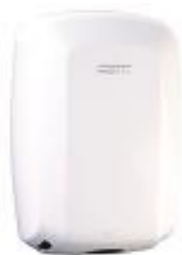
M09A White finish