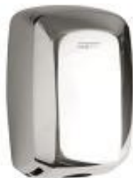
M09AC Bright finish